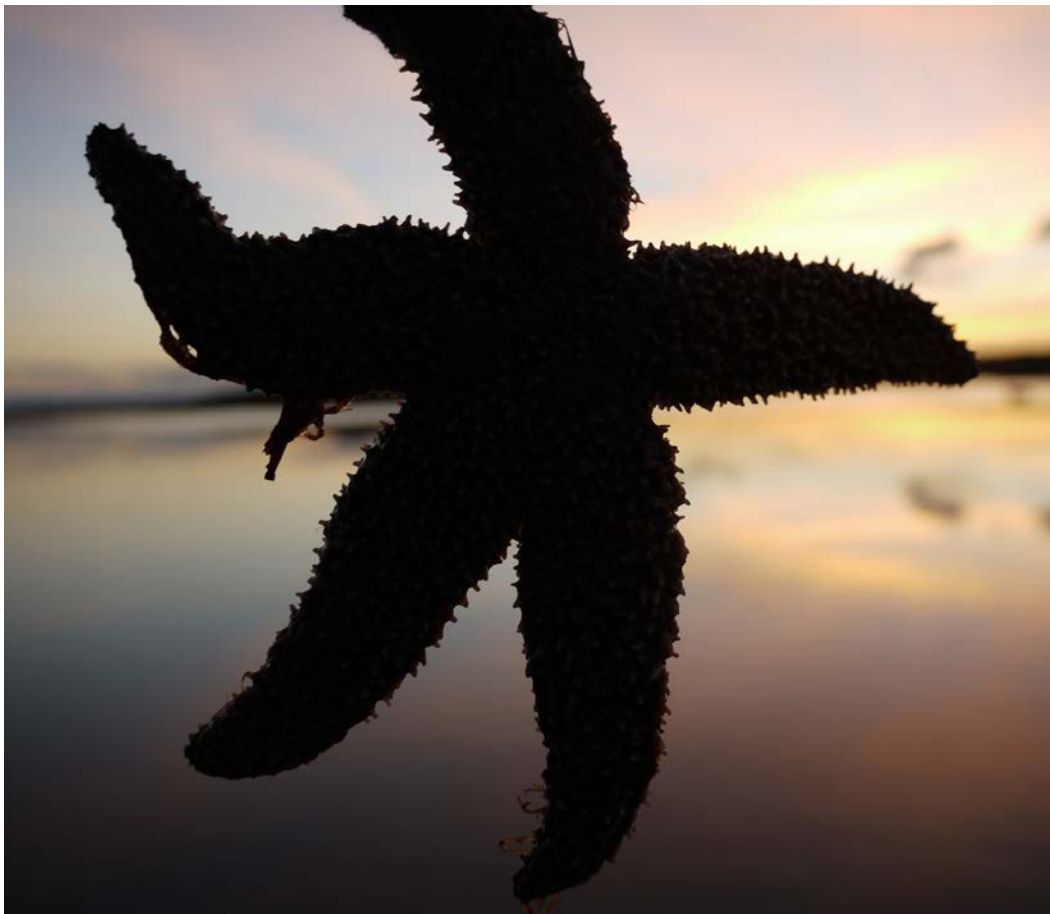
Starfish at sunset

and why they may occur, I conducted phone interviews with 22 CSFs, representing 56% of the CSFs currently in operation the United States and Canada. Results indicate CSF programs are diverse and greater consideration should be taken to understand the potential benefits of each unique model.