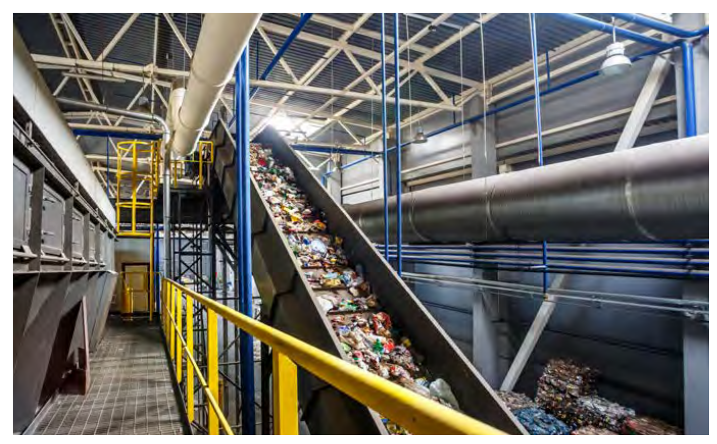
The NSW Plastics Action Plan aims to triple the plastics recycling rate by 2030.

Any future design standards would be subject to analysis of the environmental and economic impacts, consideration of any technical or performance requirements and extensive consultation with stakeholders. We will also continue to work with the federal, state and territory governments to make sure there is a uniform approach where possible.