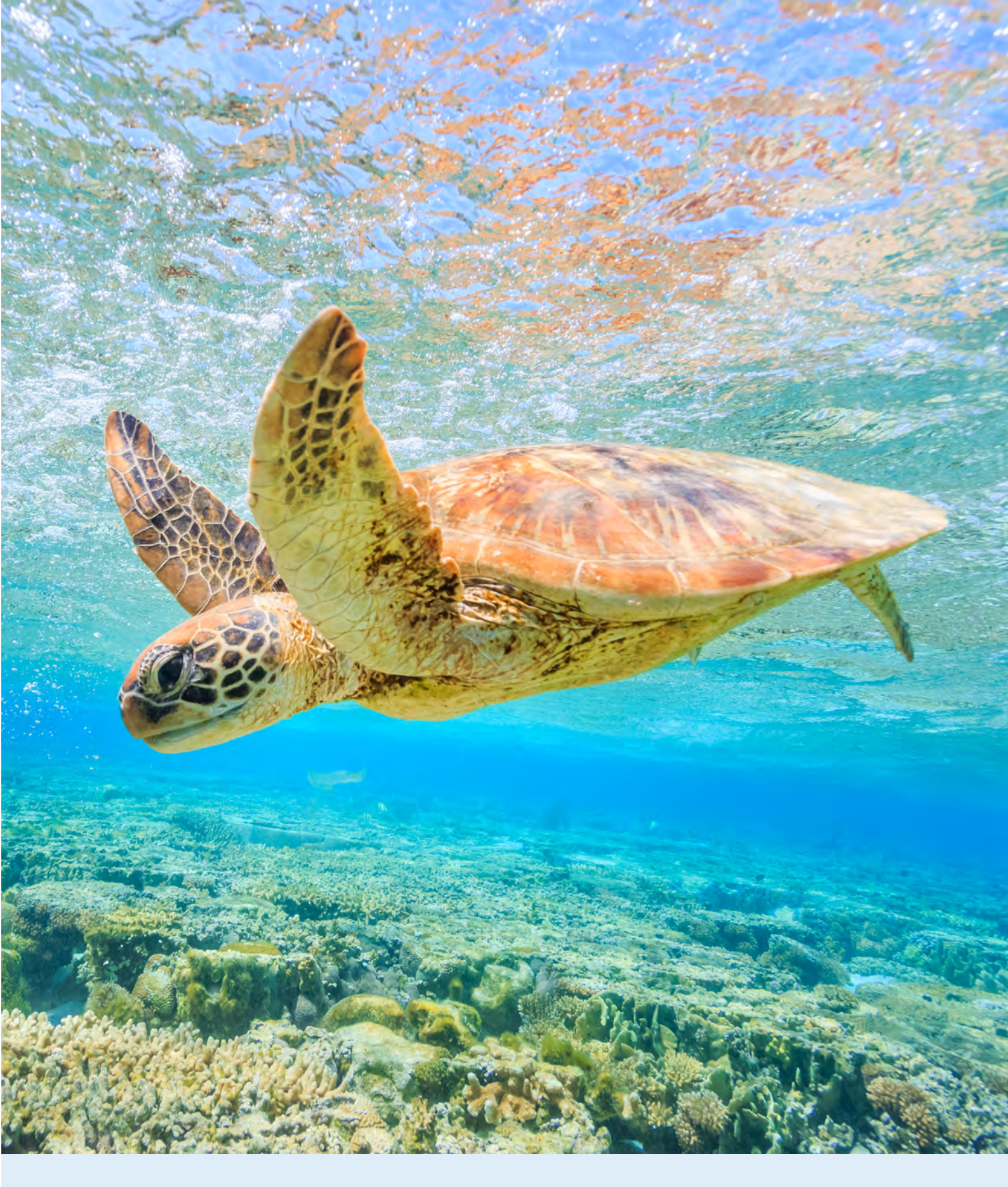
By phasing out single-use plastics, we can help stop almost 2.7 billion items of plastic litter from entering our environment and waterways over 20 years.