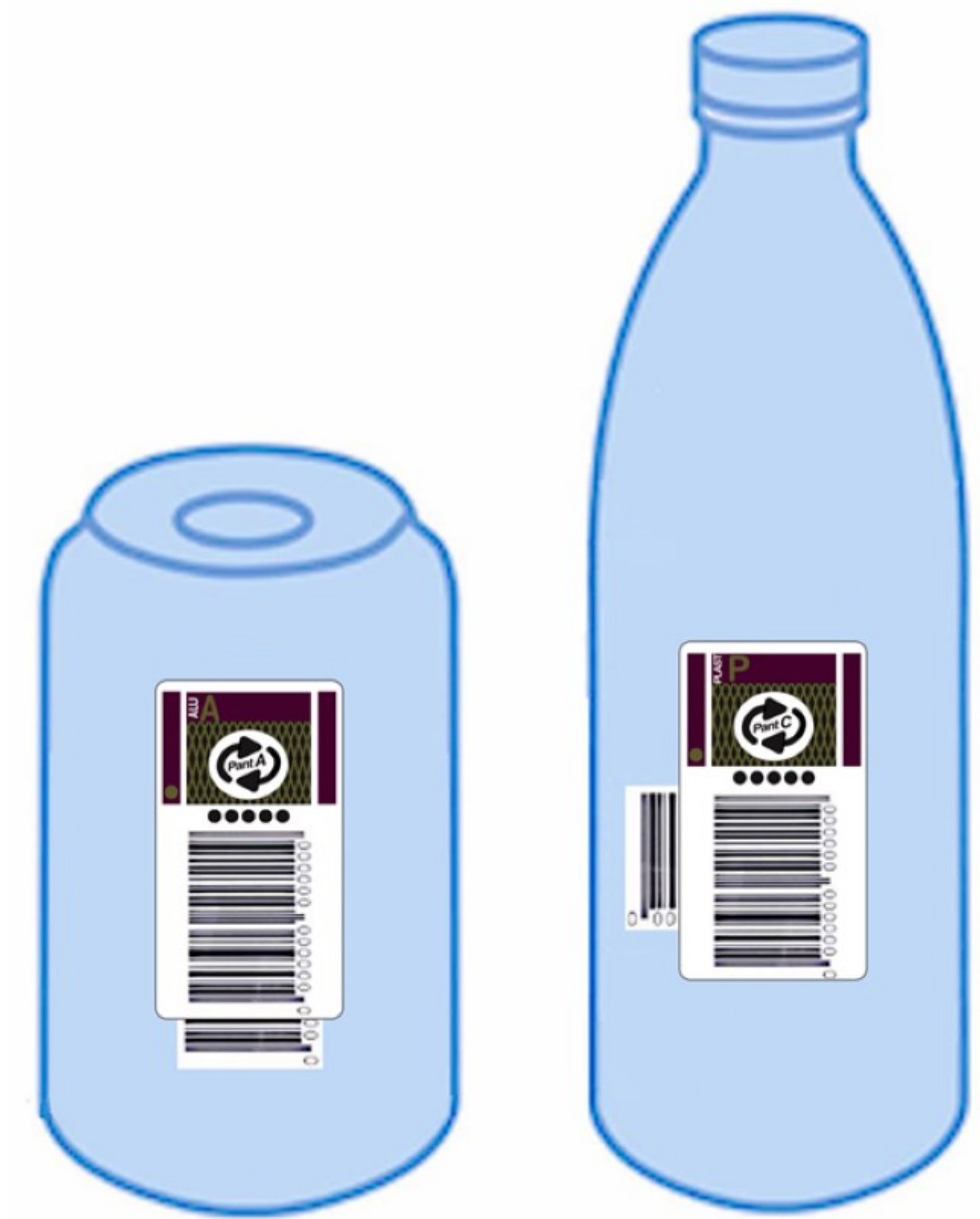
Legalisation deposit label