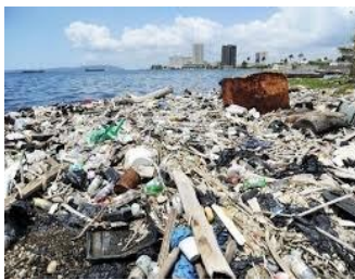
Figure 2: Dumping at Kingston Harbour, Kingston, Jamaica

All ocean-based economies depend on sustainable, healthy ecosystems to support livelihoods such as fisheries, coastal tourism, aquaculture, seabed resources, oceanic transportation, and export services (SAMOA Pathways, 2014). These industries represent major contributions to countries' gross domestic product (GDP). For example, international tourism is expected to generate $14 trillion in export earnings in 2014. Tourism ranks 5<sup>th</sup> globally for overall exports and 1<sup>st</sup> in exports for many developing countries (UNWTO 2014 Press Release, 2014).