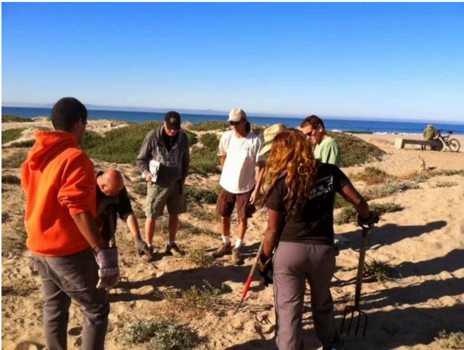
Surfers' Point volunteer workday on November 2, 2013. Volunteers weed non-native plants (mainly sea rocket, ice plant, and bermuda grass) from the dune restoration area. They also collected seed from established plants and broadcast throughout the dune areas.

complement the cobbles and help re-create dunes. Later, the project constructed dunes using sand from downcoast beaches where onshore winds were creating a problem of excess sand. Volunteers vegetated the dunes and installed signs and fencing to keep foot traffic out of the restoration area. The project also installed a stormwater filtration system to capture water from the new parking lot. The water is filtered and then discharged into the Ventura River estuary, improving water quality in both the estuary and along the adjacent shoreline.